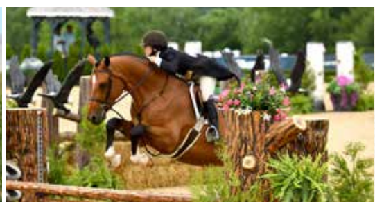
Central Spectacular June 21- 25, 2023