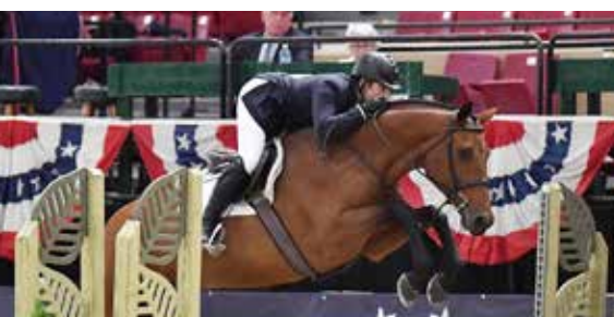
Capital Challenge October 2-8, 2023