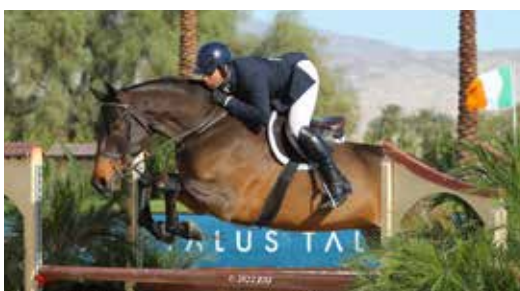
West Coast Spectacular March 15-19, 2023